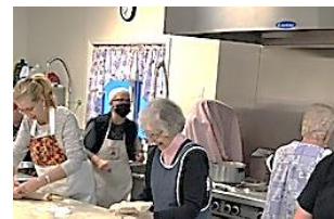
Above: WELCA and members of the congregation busy in the kitchen making the meat pies.