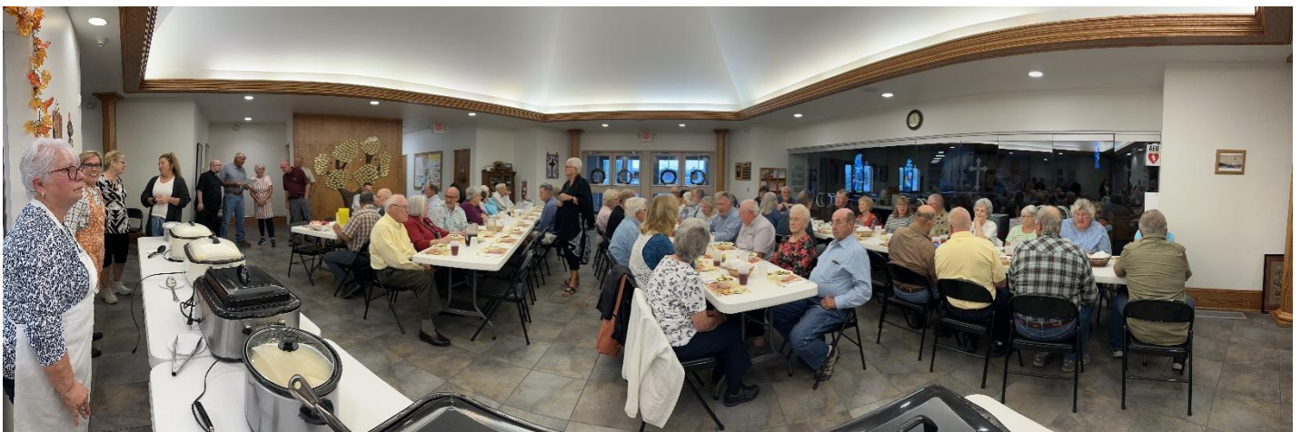
Panoramic Picture of the Fellowship Dinner